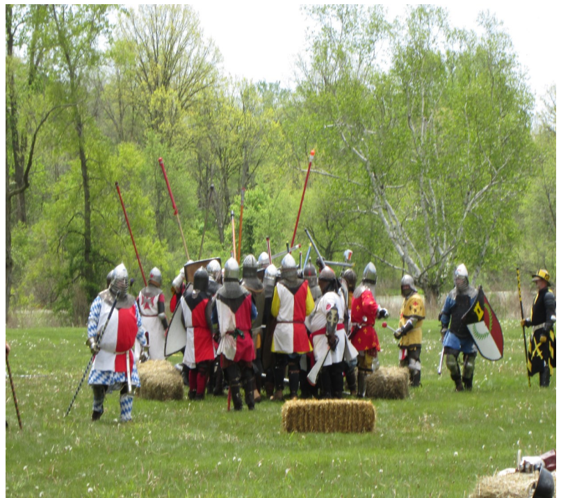
The valiant Cynnabar Baronial Muster defends the Baron's just cause at the Siege of Talonval!

For more information please visit https://www.cynnabar.org/chronicler